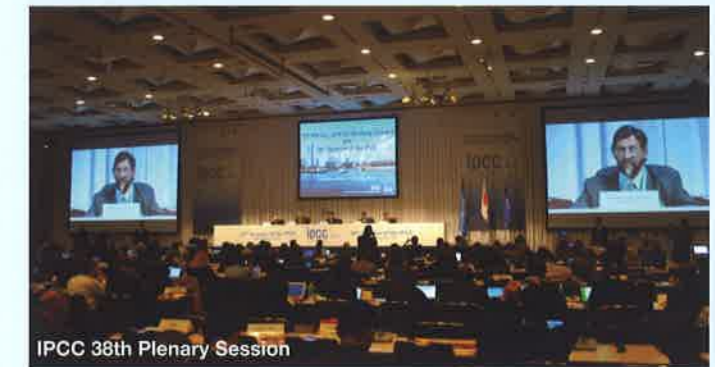
IPCC 38th Plenary Session