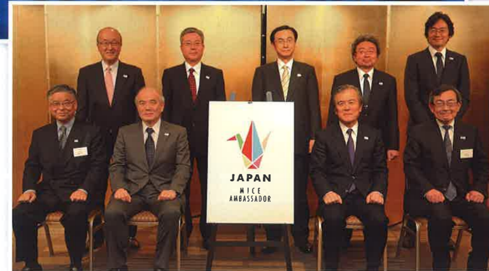
Japan has launched a Conference Ambassador Programme to help position it as the top country in Asia for international conferences. The team of well qualified, influential and passionate ambassadors will help to promote Japan as a world-class conference destination and be involved in bid preparation supported by the Japan Tourism Agency and Japan National Tourism Organization.